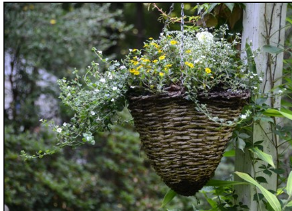
I bought a pot of four plants and plugged them right into some left over hanging baskets.

Getting a garden bargain is almost as exciting as planting for someone cheap like me.